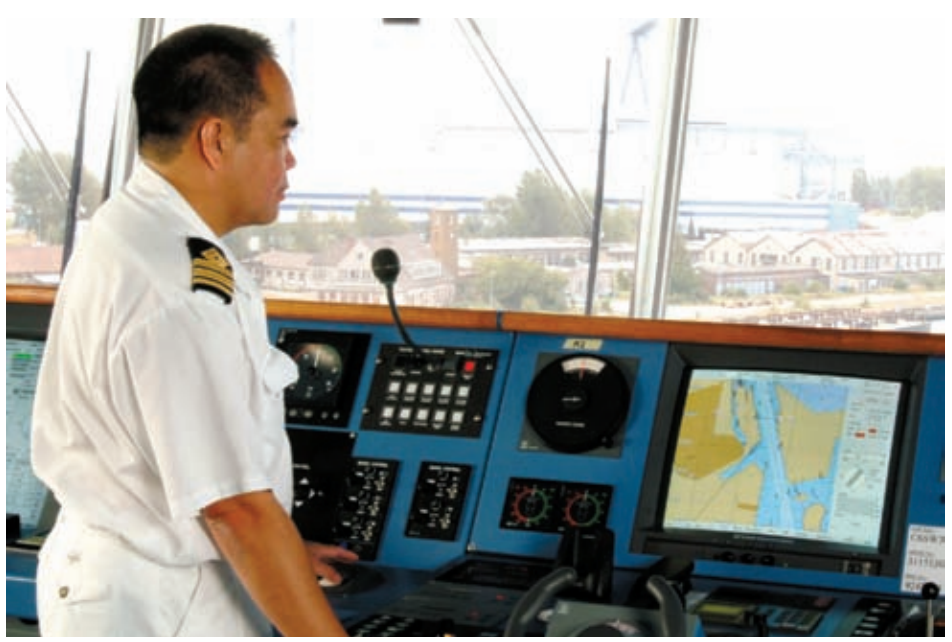
Electronic charts and ECDIS can make it easier to update folios, and may also reduce the burden on the navigator

Satellite connectivity can allow a vessel, in the deepest parts of the ocean and far from land, to be updated with the most accurate charts available almost instantaneously.